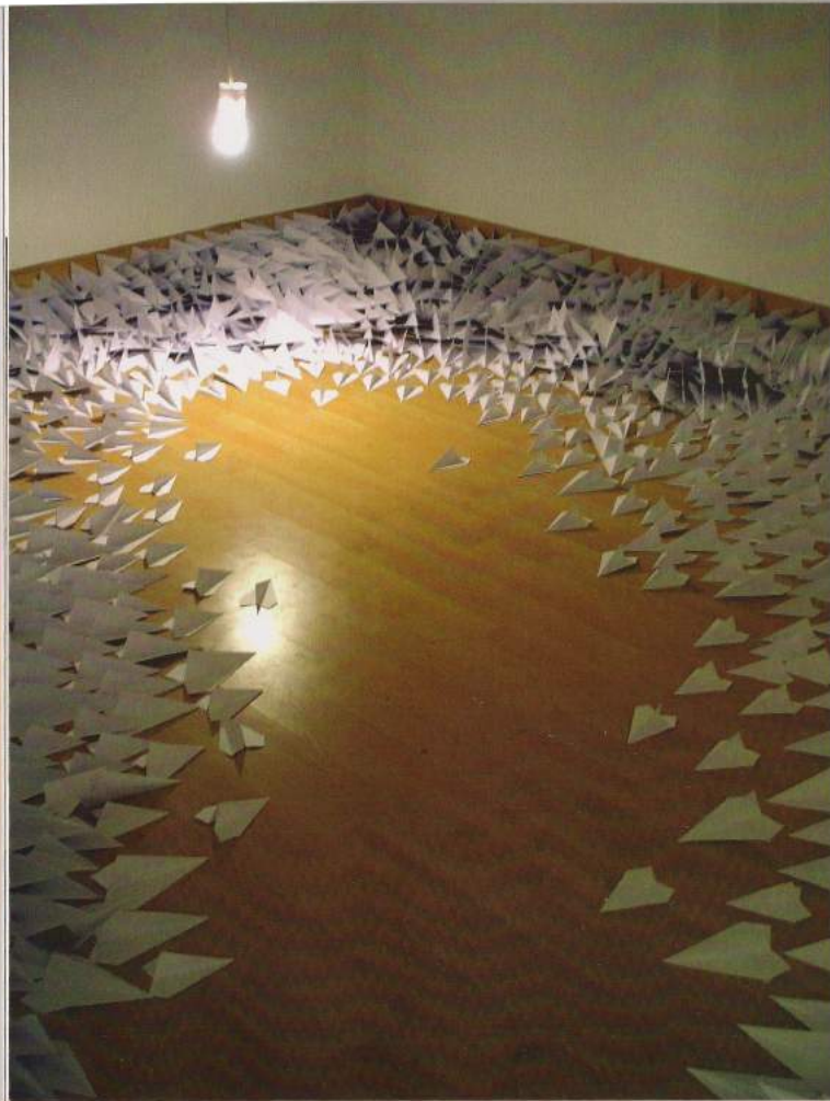
Baptist Coelho 2009 Finally Found My Room Full of Toys Site-specific installation with paper airplanes and audio Edition 1/3 Variable size (Audio - 4 minutes loop)