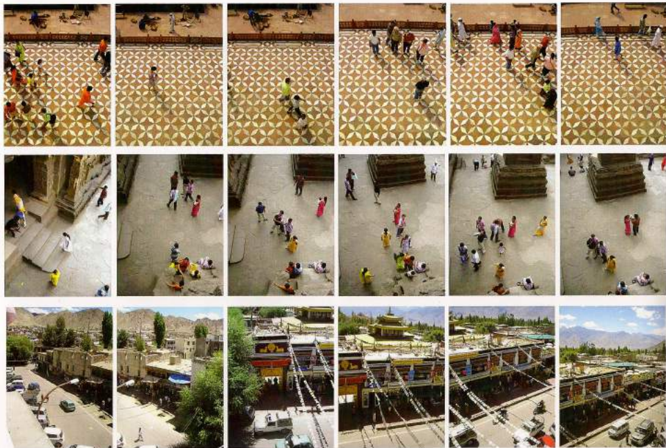
6 Digital prints on archival paper View #5 [Agra - Taj Mahal] View #6 [Aurangabad - Ellora Caves] View #7 [Ladakh - Leh] View #4 [Mumbai - Malad West] Opposite page