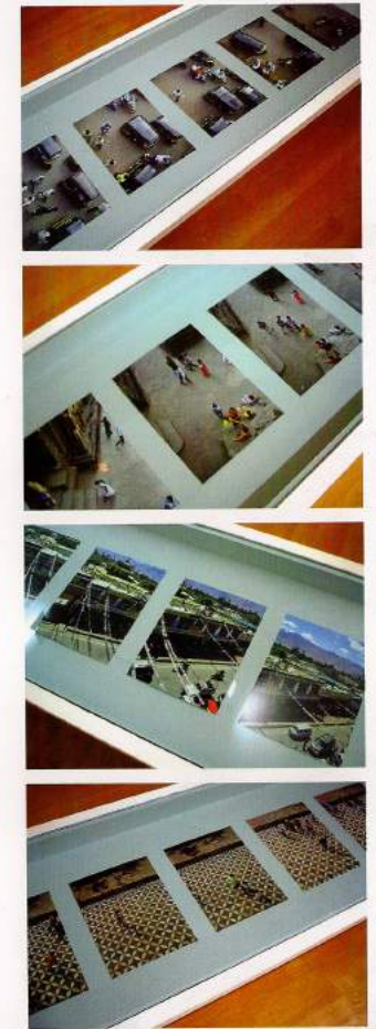
Detail of Vitrines