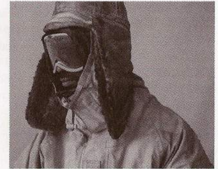
"Beneath it all... I am human"

experiences discrimination based on the simple act of crossing his legs, which may be viewed as submissive and feminine. Unconscious and spontaneous mannerisms often become imbued with social meaning and prejudice of the understated can be read as the other. While exploring societal disparities between the masculine and feminine, one is commonly confronted with the deep-rooted stigmatization of sexuality.