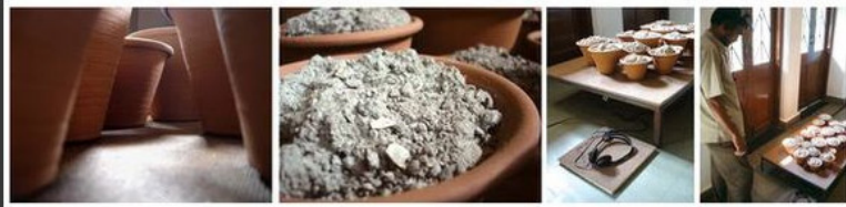
Construction MP3, 3:59 min.