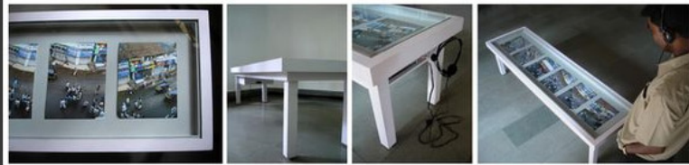
Santa Cruz West MP3, 2:00 min.